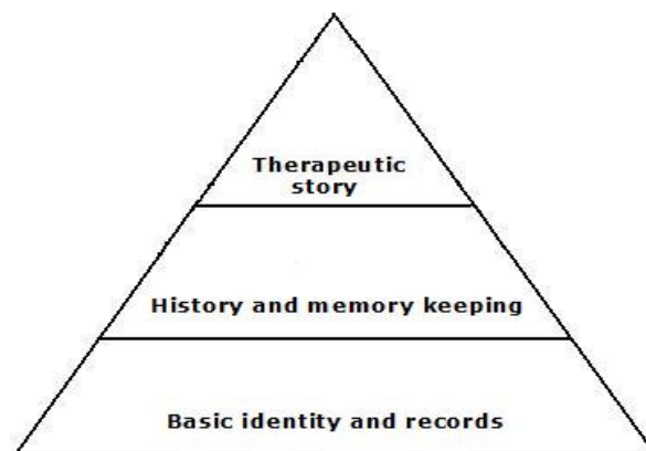
Figure 1: The Life Story pyramid: a conceptualisation

Participants’ responses to this conceptualisation were sought. The pyramid stimulated considerable discussion, moving toward general consensus that all elements are necessary, and that a hierarchy might not be the best representation of their relationship with each other or their importance in practice. An alternative was suggested – a three way interaction, one possible depiction is given below.